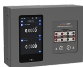
Panel Mount Version

ADT226 ADT226Ex: Intrinsically Safe ADT226P: Panel Mount