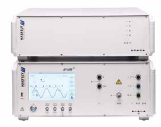
AXOS<sup>5</sup> & DIP 116 Dips Transformer